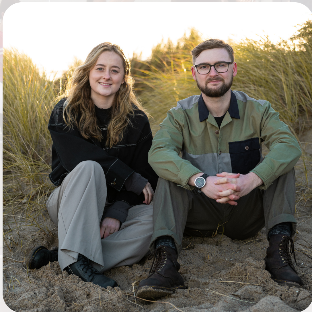
Founders & Directors